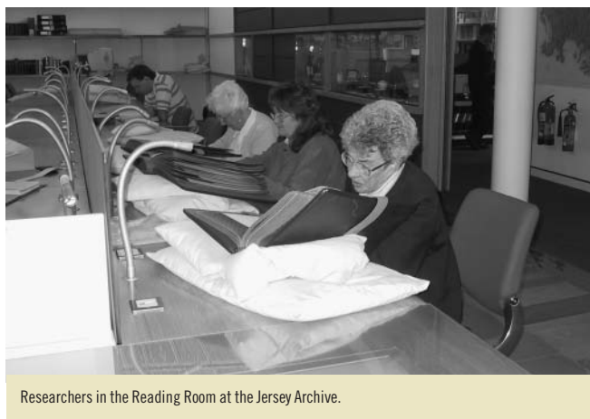
Researchers in the Reading Room at the Jersey Archive.

After the arrival of German troops on 1st July 1940, the Superior Council was established to act as a buffer between the occupying army and the civil population. The Bailiff was appointed head of the Council, which included the