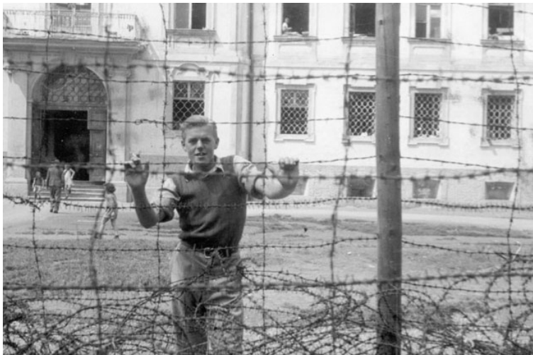
Image of deportee standing behind a barbed wire fence.

Archive material concerning the Occupation of the Channel Islands can also be found in the National Archives of England, France and Germany. The National Archive at Kew