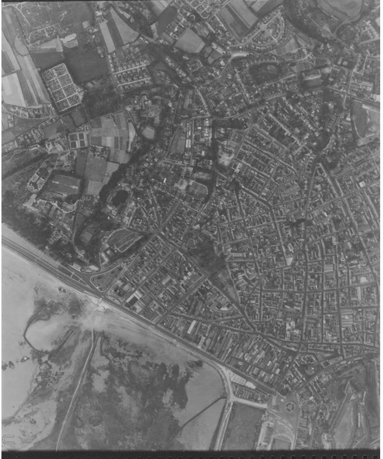
Aerial reconnaissance photograph taken of St Helier in 1944.