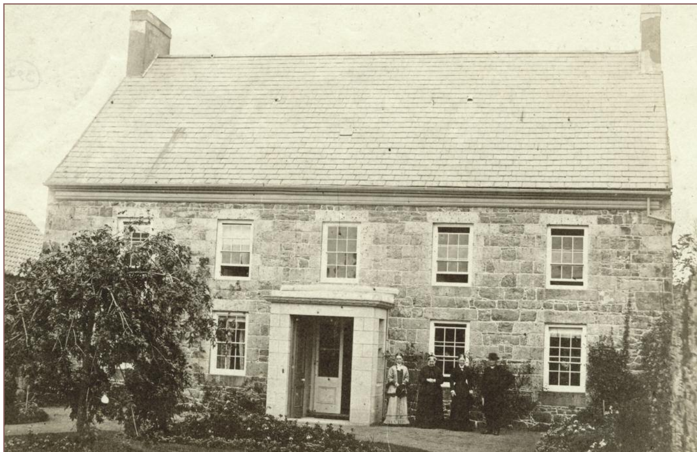
St Ouen's Rectory