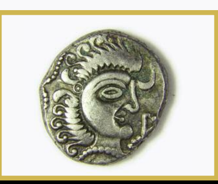
Billon staters of the XN Series