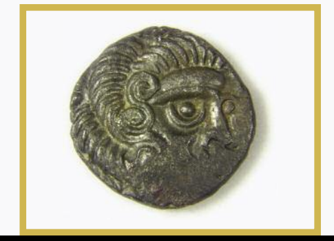
Billon quarter staters of the Coriosolites tribe

The obverse is characterised by a head in a distinct half-moon shape, and the four different classes of coin are differentiated by hairstyle and the triple-circle tattoo on the cheek. The reverse shows little variation, a human-headed horse, beneath which is a vertical lyre and usually two circles or stars. Above the horse is a hampe similar to that of the early Coriosolite coins and on some a boar standard in front.