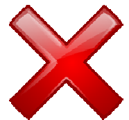
X marks the spot