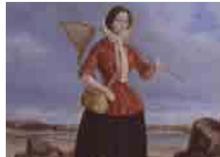
The Shrimping Girl By Thomas Berteau Oil on canvas (Maritime Museum)