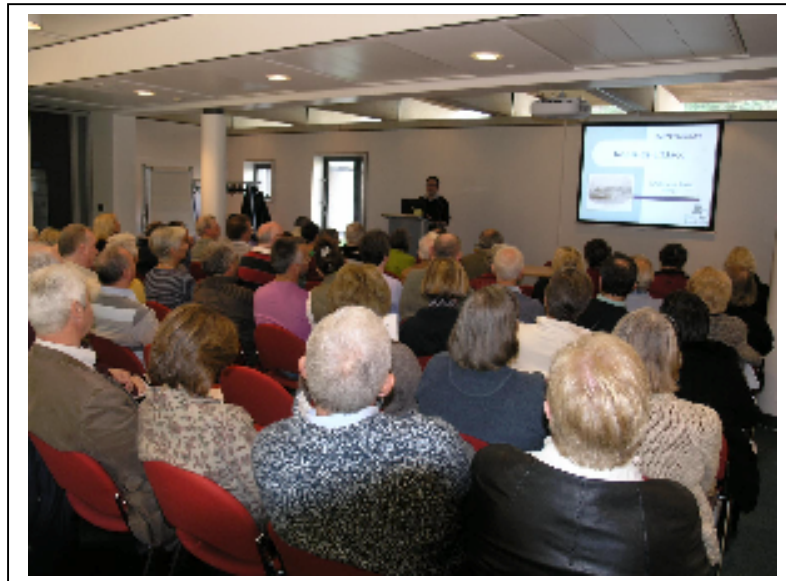
What's Your Street's Story Talk, 2010

The Archive's sponsored Saturday morning opening programme of talks continued in 2010. The What's Your Street's Story project focused on different areas of the community and encouraged members of the public to learn more about their Island. The programme proved to be extremely popular with nearly three times more people visiting the Archive on open Saturdays than on an average weekday.