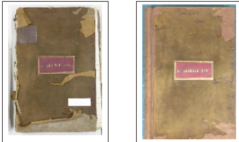
General Don letter book before and after treatment.

In 2010 the Conservator spent 353 hours ensuring that all public records arriving at the archive were cleaned and repackaged. The Conservator is also responsible for a programme of conservation of badly damaged items. In 2010 25 items were fully conserved using an external firm. The archive currently holds 489 items in an unusable condition that are in need of active conservation work and are currently unavailable to members of the public.