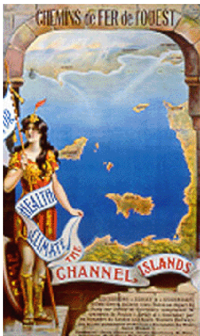
▲ Channel Islands for Health and Climate c.1930